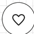
Snare drum (Heart)