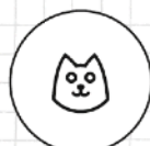
Bass drum (Cat)

To help distinguish the individual components or parts of the drum kit from one another, we can give them a playful 'notation' consisting of easy-to-remember symbols.